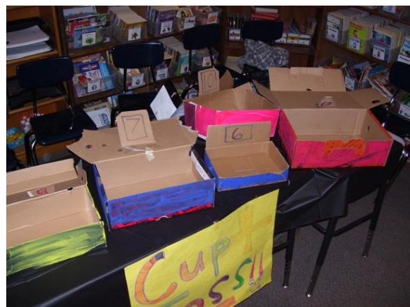
Addition/Subtraction Cup Toss