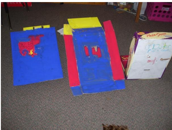
Multiplication Monster Truck Jumps